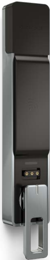
Surface Mount Hybrid ADA Knob on Bottom