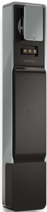
Surface Mount Hybrid Knob on Top