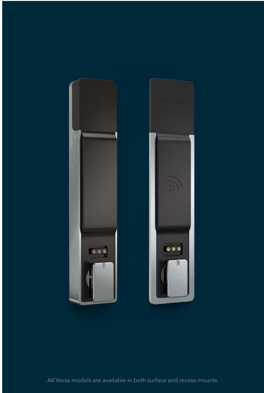
All Versa models are available in both surface and recess mounts.