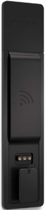
Recessed Mount Hybrid Knob on Bottom

Choose from Brushed Nickel and Matte Black Finishes with Surface and Recess Mount Options.